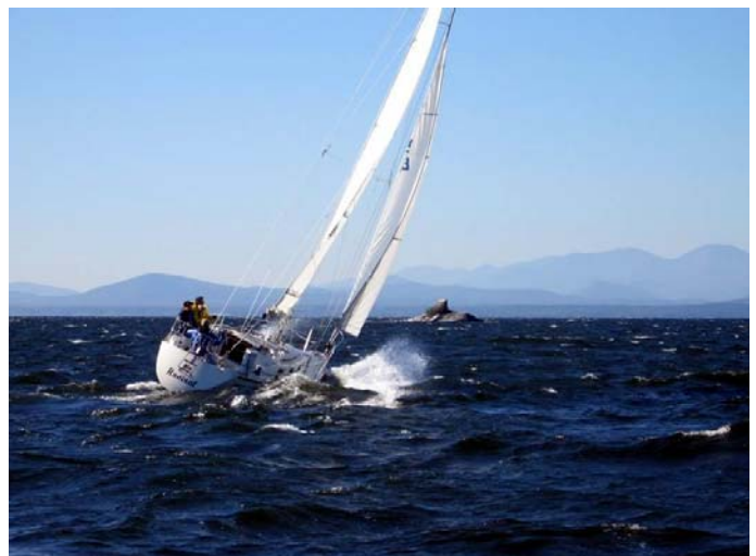
It's a Radiant Day for Sailing, in More Ways than One, at the 2005 Hot Ruddered Bum