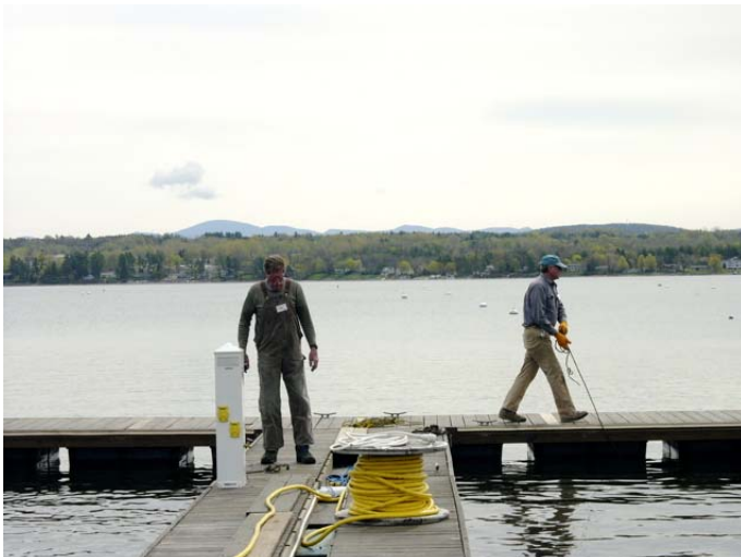
Working to Install the Dock Kiosks—Workday 2006