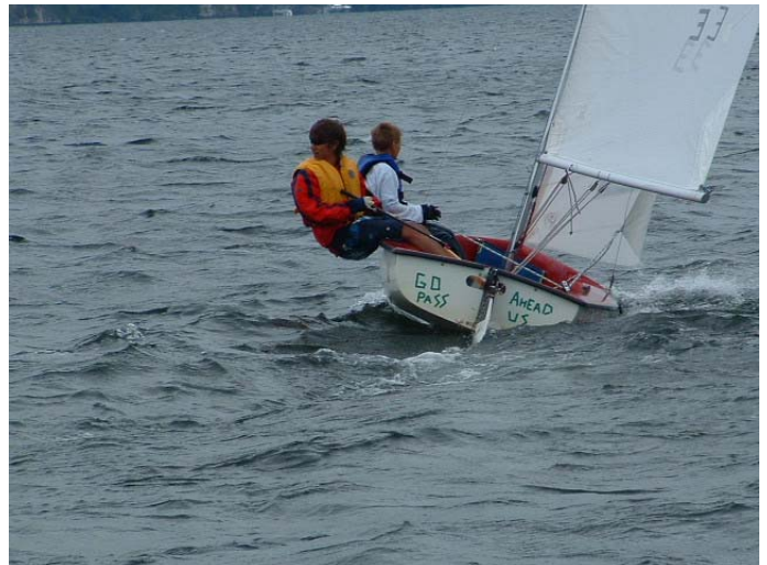
Checking Out the Competition at the 2005 Junior Sailing Regatta